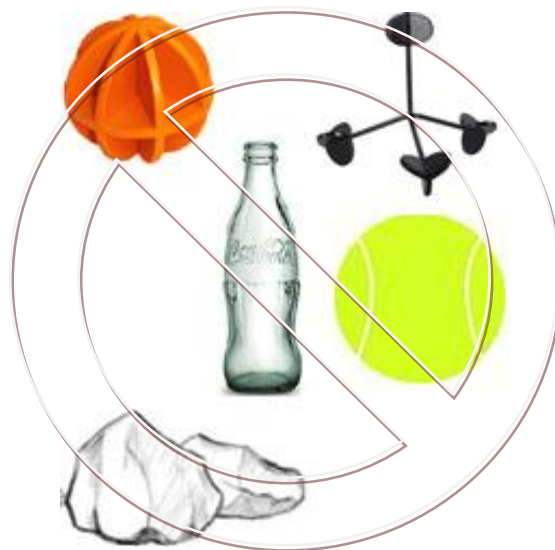
Examples of PROHIBITED ground targets